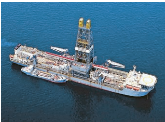
Fig. 1. Discoverer Enterprise , dual-activity, DP drillship during refueling operation.

Rig offsets pose another complication for dual activity. Where an offset is required, for example, when drilling from a zero riser angle position rather than immediately over the wellhead, care must be exercised in running tubulars from the second rotary. Safe heading zones must be observed to avoid