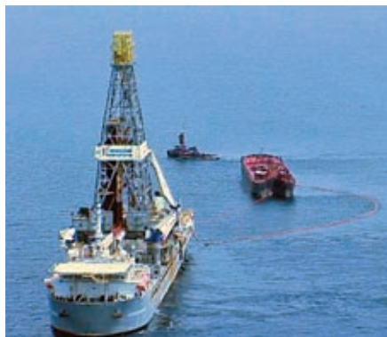
Fig. 3. Crude oil tandem offloading.